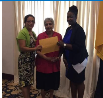
Guyana Goldfields donates for transportation costs