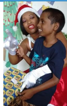
Christmas 2015 at the School