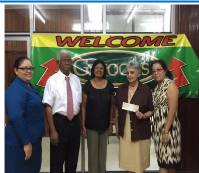
A generous donation from the Gafoor Foundation